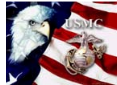
GOD BLESS AMERICA