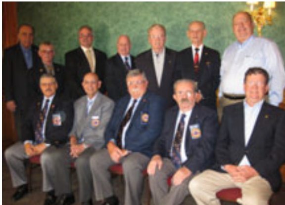
Board of Directors, Los Angeles County Chapter, Inc.