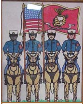
United States Marine Corps Mounted Color Guard Bodfish Campout, 13-15 Feb'09

Los Angeles County Chapter, Inc. 1st Marine Division Association 24415 Lisa Kelton Place Newhall, CA 91321