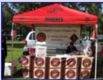
LA Chapter Recruiting Booth

It helped to recruit one new member, on the spot, and give info and applications to six other 1st Mar. Div. Veterans.