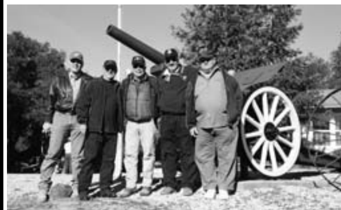
Could this be the mystery "Cannon Paint Crew" ? The Boys from Texas? The eyes of Texas our upon us!