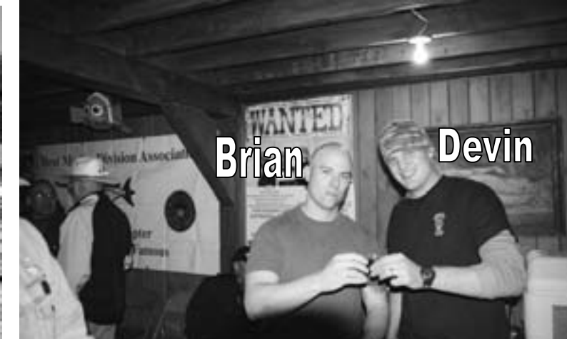
It's time to relax and "Wet Down" the awards in the Bodfish Saloon