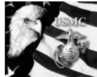
GOD BLESS AMERICA