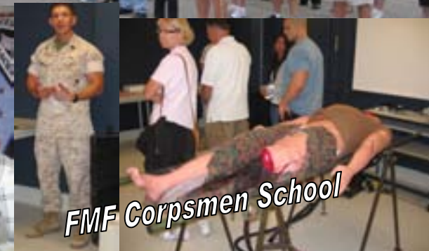
FMF Corpsmen School