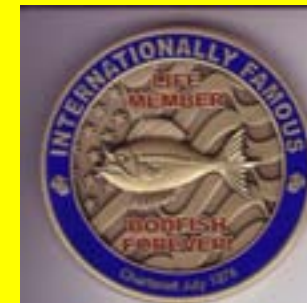
Back Side of Coin

Designed by Dale Turner and minted by Northwest Territorial Mint, USA