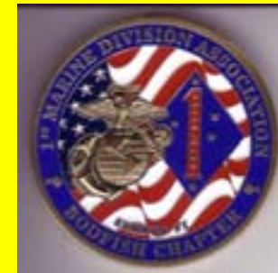
Front Side of Coin