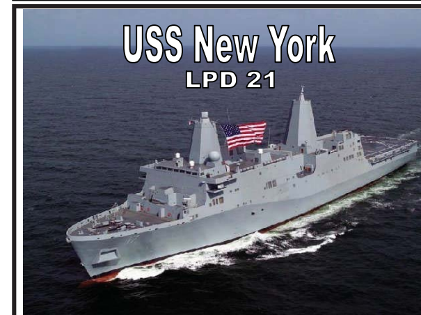
USS New York LPD 21

It was built with 24 tons of scrap steel from the World Trade Center .