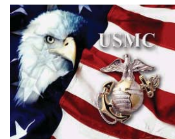
GOD BLESS AMERICA